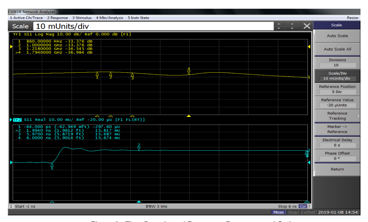
Figure 3 - Time Domain and Frequency Response and Gating

9.5. Select the ANALYSIS menu. In this menu select the GATING menu. Set the gate start time to -2 ns, and the gate stop time to +2.6 ns. Turn the gating ON. This should remove the far end termination response. The upper trace of Figure 3 shows a typical time gated trace.